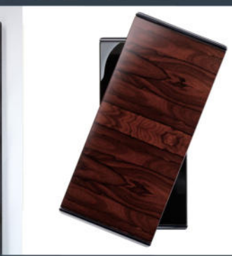
Vienna Acoustics Liszt, 2014 - 2022